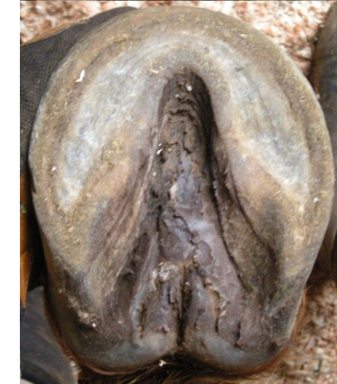
Day 25 No Thrush