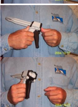
Step 4. Empty assembled dispenser.

Step 3: Continue sliding the plunger into the dispenser until fully inserted.