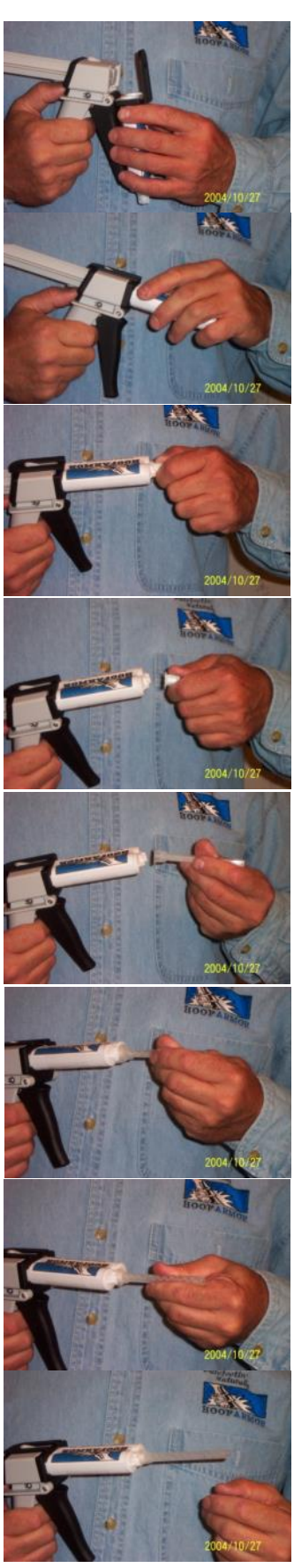
Step 8: Snap black clip closed.

Step 7. Slip cartridge into dispenser matching large and small openings in the cartridge with the large and small openings in the dispenser.